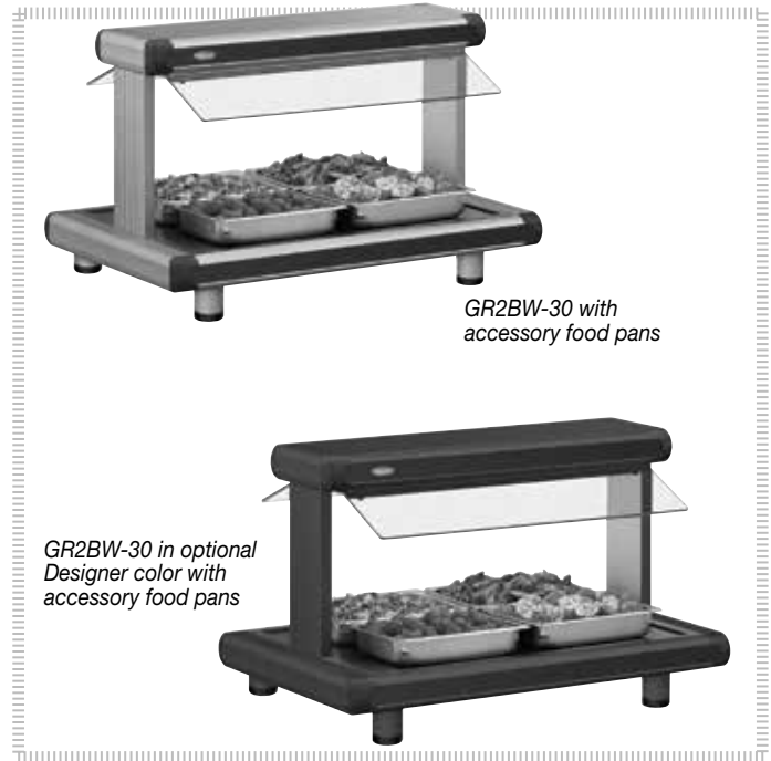
GR2BW-30 with accessory food pans