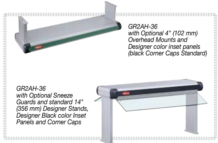
GR2AH-36 with Optional 4" (102 mm) Overhead Mounts and Designer color inset panels (black Corner Caps Standard)