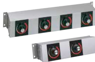
RMB-14E with infinite controls