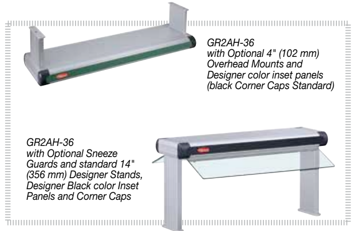
GR2AH-36 with Optional 4" (102 mm) Overhead Mounts and Designer color inset panels (black Corner Caps Standard)