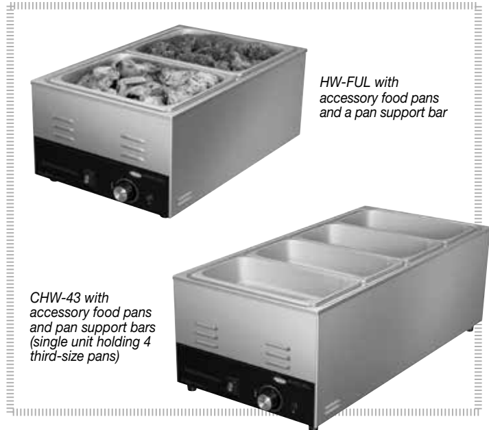
HW-FUL with accessory food pans and a pan support bar