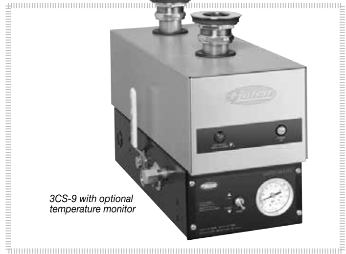
3CS-9 with optional temperature monitor