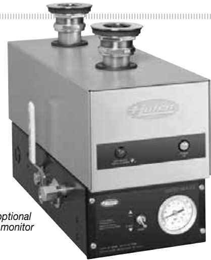
3CS-9 with optional temperature monitor