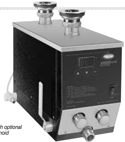
3CS2-3 Patented with optional auto-fill solenoid