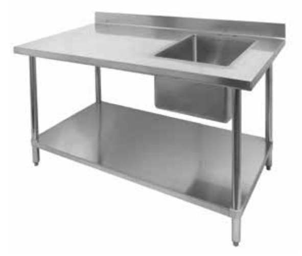
Right Hand Sink Bowl WT-PS3048R