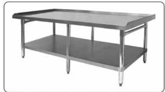
60" & 72" have 6 legs