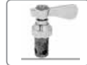
AA-102G & AA-103G