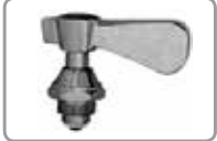
AA-100G & AA-101G