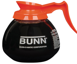
DECANTER, GLASS- ORN 12 CUP 1PK