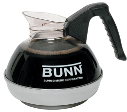
EASY POUR,(BLK) 2/CS