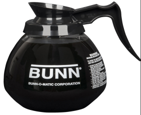
DECANTER, GLASS-BLK 12C 3/CS