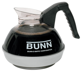
EASY POUR,(BLK) 6/CS