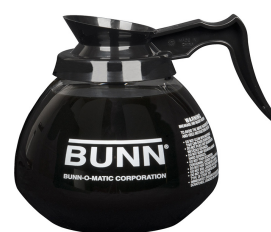
DECANTER,GLASS-BLK 12C 24/CS