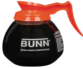
DECANTER, GLASS-ORN 12C 24/CS