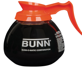
DECANTER, GLASS-ORN 12C 3/CS