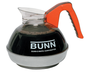
EASY POUR,(ORN) 6/CS