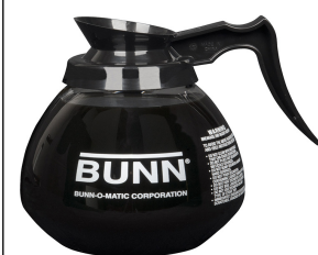
DECANTER,GLASS-BLK 12CUP 1PK