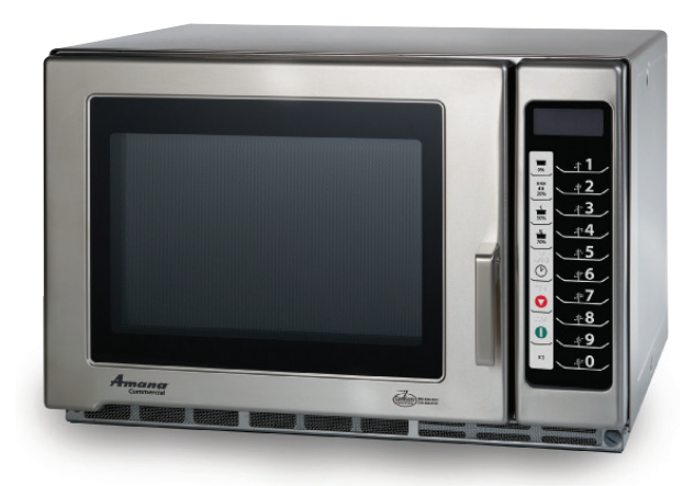
Model RFS12TS shown