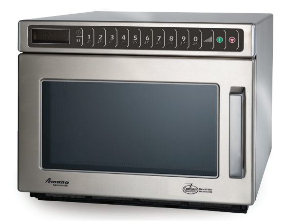
Model HDC1815 shown