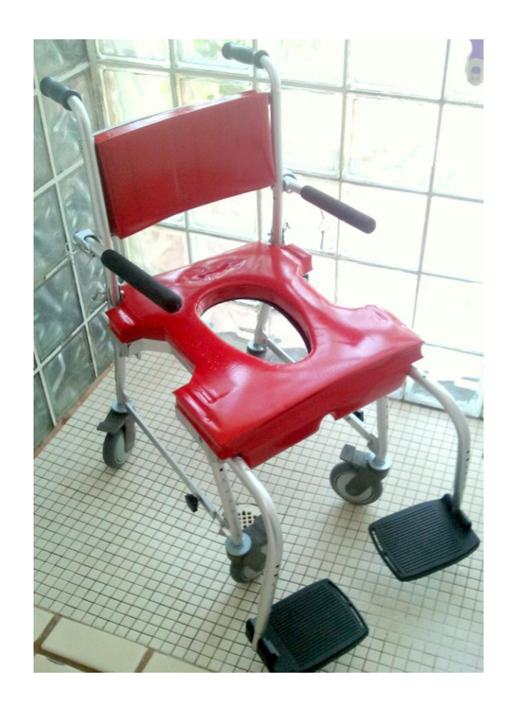
THE "GO-ANYWHERE" COMMODE 'n SHOWER CHAIR