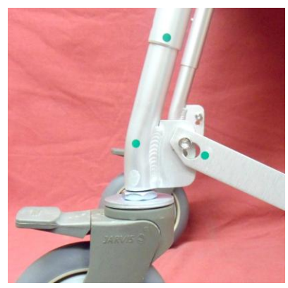
IMPORTANT: Never attempt to use your Go-Anywhere Chair™ without both cross-braces being properly installed. Using the chair without them could result in structural failure which, in turn, may cause serious injury or death.