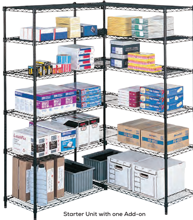
Starter Unit with one Add-on