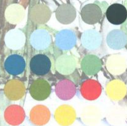
L - Landscape

P7, P15, P16, P26, P31, P36, P41, P55, P56, P62, P69, P81, P98, P100, P102, P119, P137, P142, P149, P182, P184, P186, P188, P210, P220