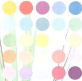
F - Pastel

P98, P99, P100, P180, P181, P182, P183, P184, P185, P186, P187, P188, P189, P190, P191, P192, P193, P194, P195, P196, P197, P198, P226, P227, P229