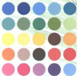
A - Basic

P4, P6, P10, P15, P16, P19, P21, P26, P31, P38, P41, P46, P50, P57, P64, P69, P70, P75, P79, P81, P89, P90, P92, P94, P102