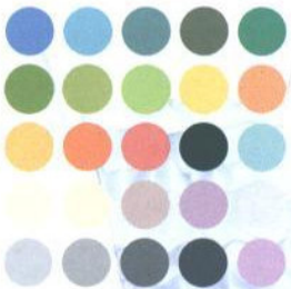
J - Architectural

P-0 (2 pieces), P50, P55, P56, P57, P62, P69, P70, P71, P74, P75, P137, P138, P139, P140, P142, P146, P147, P148, P149, (2 pieces), P152, P156, P160