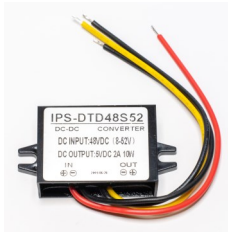
24/48v to 5v DC Converter

IMPORTANT: Please note that DC voltage drops as the length of wire increases — be sure the voltage provided by your power supply, measured at the point you'll connect the 24/48v DC to 5v DC converter is between 8 and 58v DC. For additional information on voltage drop, or how to calculate it for your situation, please visit http://bit.ly/VDropCalc .