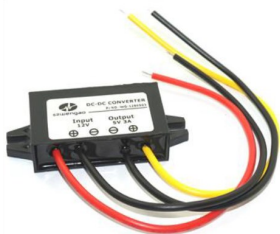
12v to 5v DC Converter

IMPORTANT: Please note that DC voltage drops as the length of wire increases — be sure the voltage provided by your power supply, measured at the point you'll connect the 12v DC to 5v DC converter is between 6 and 20v DC. For additional information on voltage drop, or how to calculate it for your situation, please visit http://bit.ly/VDropCalc .