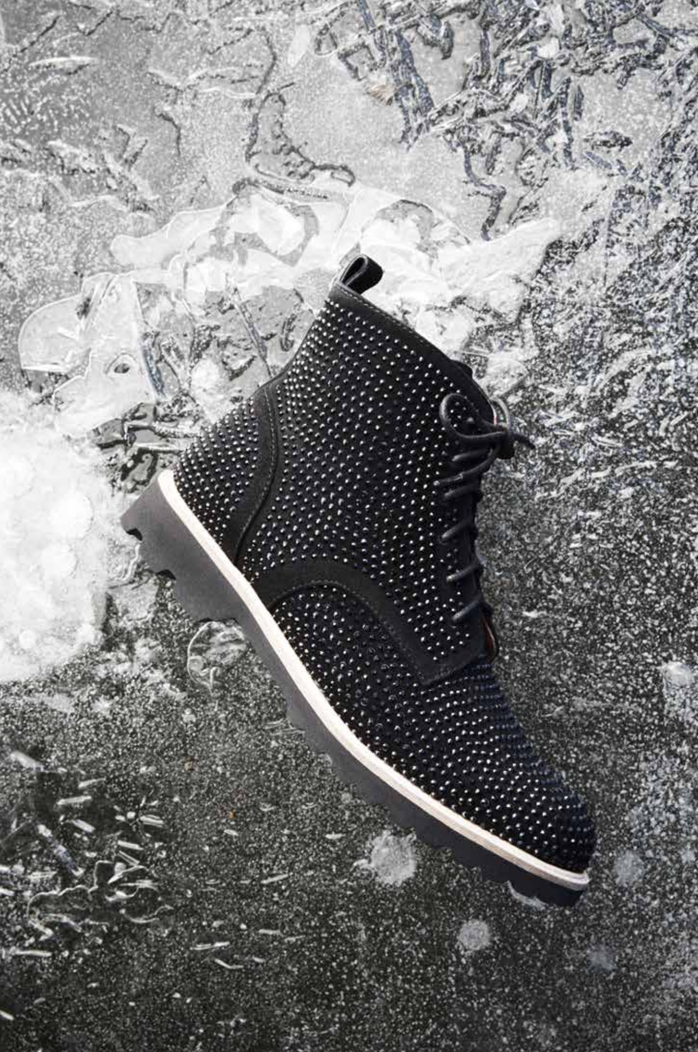
L'Amour Des Pieds studded hiker. Opposite: Platform work boot by All Black, Joynoëlle sand skirt and jacket.