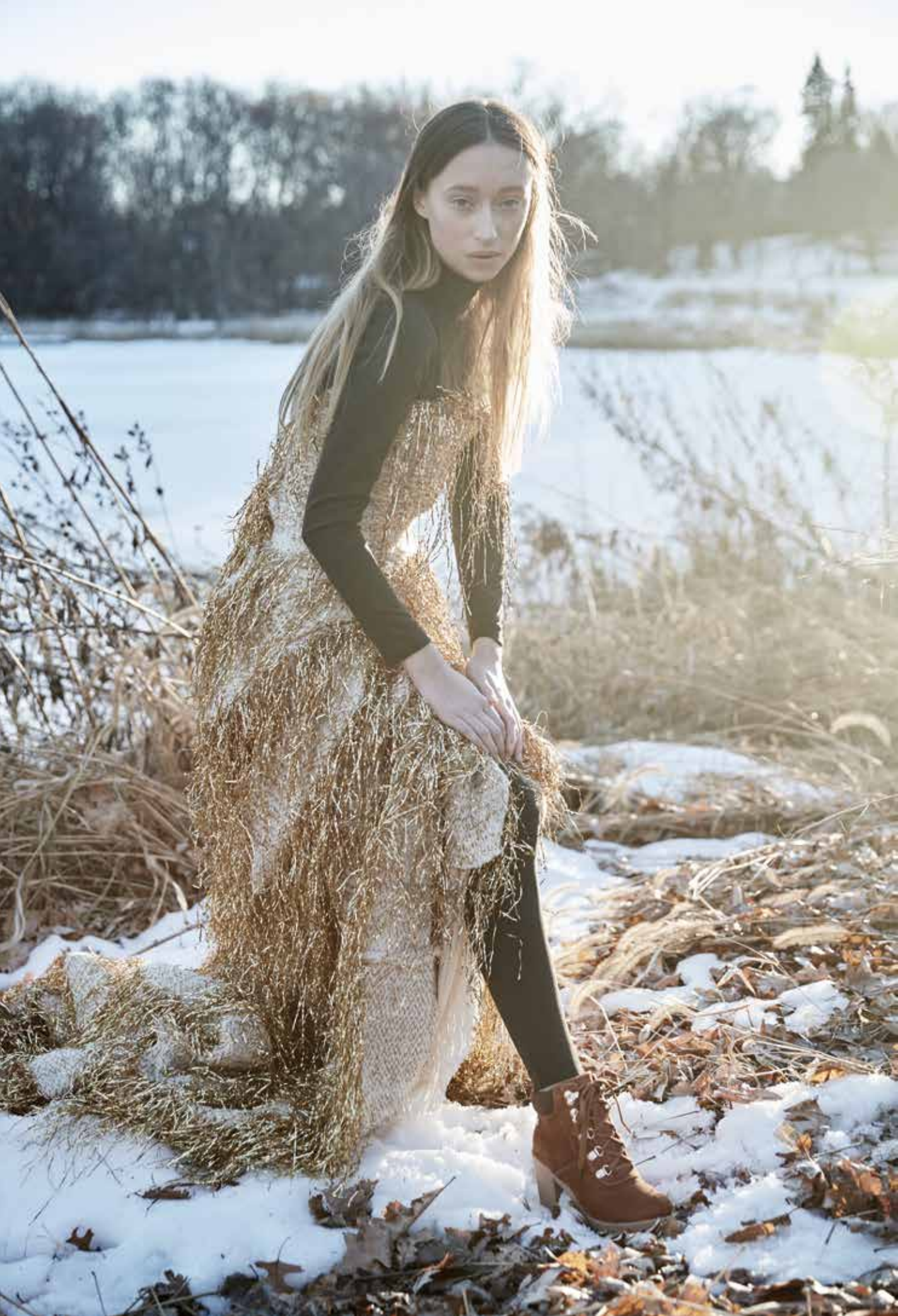
Secret Celebrity alpine hiker, Joynoëlle dress and tights. Opposite, clockwise from top: J/Slides utility boot, wedge boot by Pendleton , Spring Step hiker.