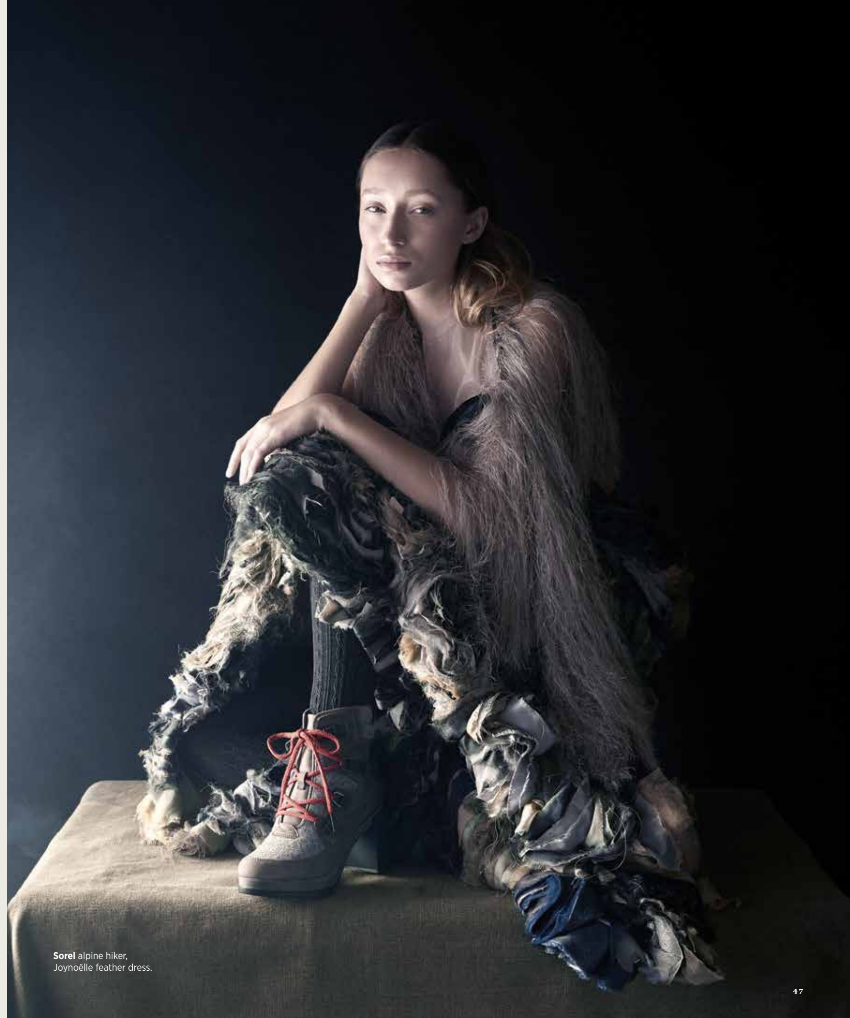
Sorel alpine hiker, Joynoëlle feather dress.