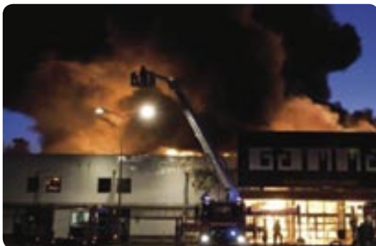
Insulation material type is not the most important factor, e.g. 2008 fire at a Gamma DIY store (NL) with non-combustible insulation.

A high percentage of fires is caused by arson, so not only smoke alarms and sprinklers but also burglar alarms, fencing and entrance protection systems need to be considered.