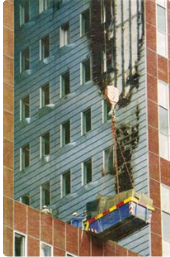
Details are important! Unless warnings from the roofing constructor they choose the cheaper detail. Result; the wooden substructure caught fire.