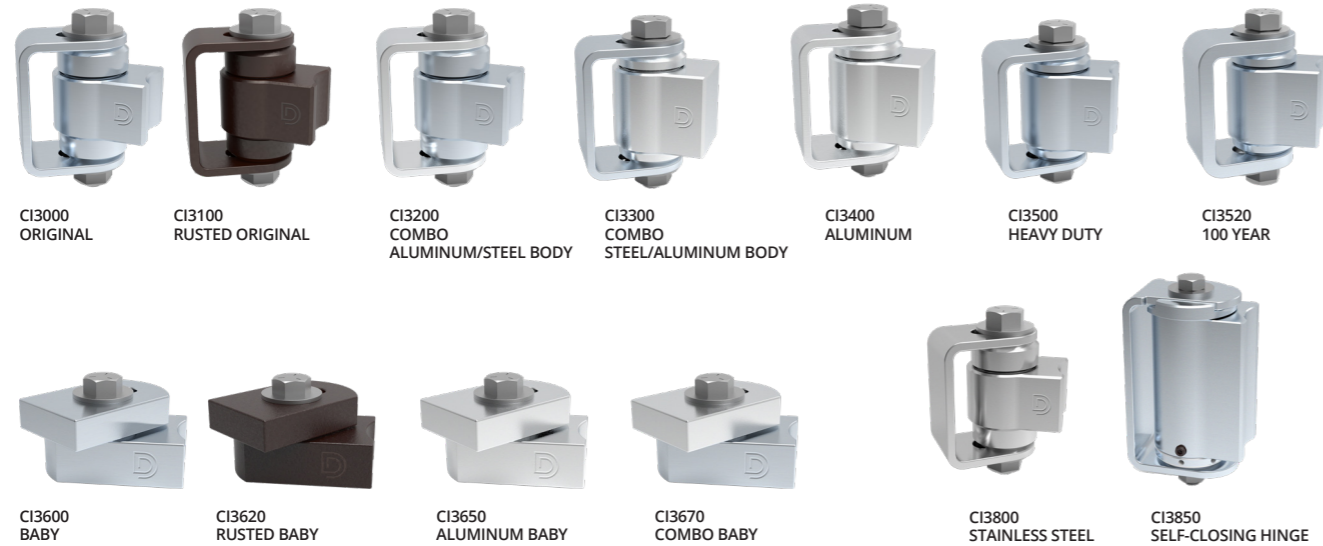
CI3000 ORIGINAL CI3100 RUSTED ORIGINAL CI3200 COMBO ALUMINUM/STEEL BODY CI3300 COMBO STEEL/ALUMINUM BODY CI3400 ALUMINUM CI3500 HEAVY DUTY CI3520 100 YEAR CI3600 BABY CI3620 RUSTED BABY CI3650 ALUMINUM BABY CI3670 COMBO BABY CI3800 STAINLESS STEEL CI3850 SELF-CLOSING HINGE