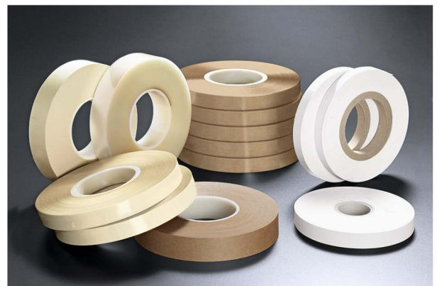
Assorted tapes available online