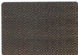
• Linen Texture

• Various types of embossing offer high quality and capacity on demand