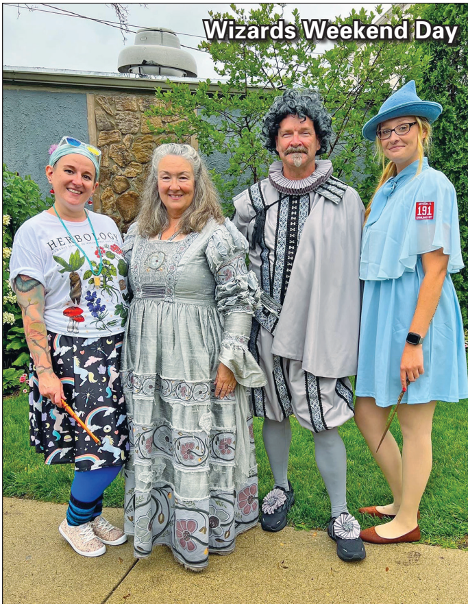
Wizards Weekend Day