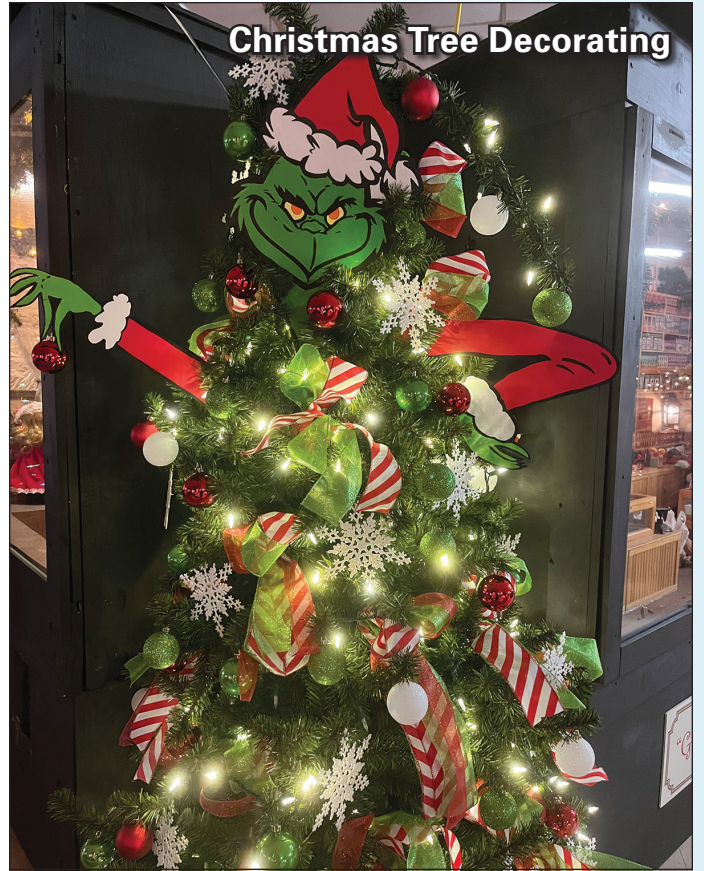
Christmas Tree Decorating