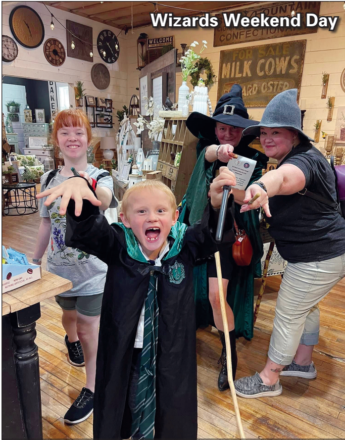
Wizards Weekend Day