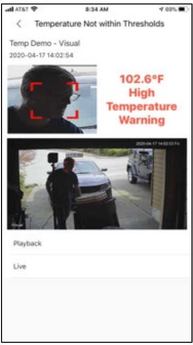
Figure 4: Sample alert of a person with an elevated skin temperature

The gaming and hospitality industry will also benefit from the deployment of thermal temperature monitoring devices at entrances / exits and throughout the facility. For a person with an elevated temperature, a visual alert is sent so that security personnel has a visual image of the person's identity and can re-check their temperature.