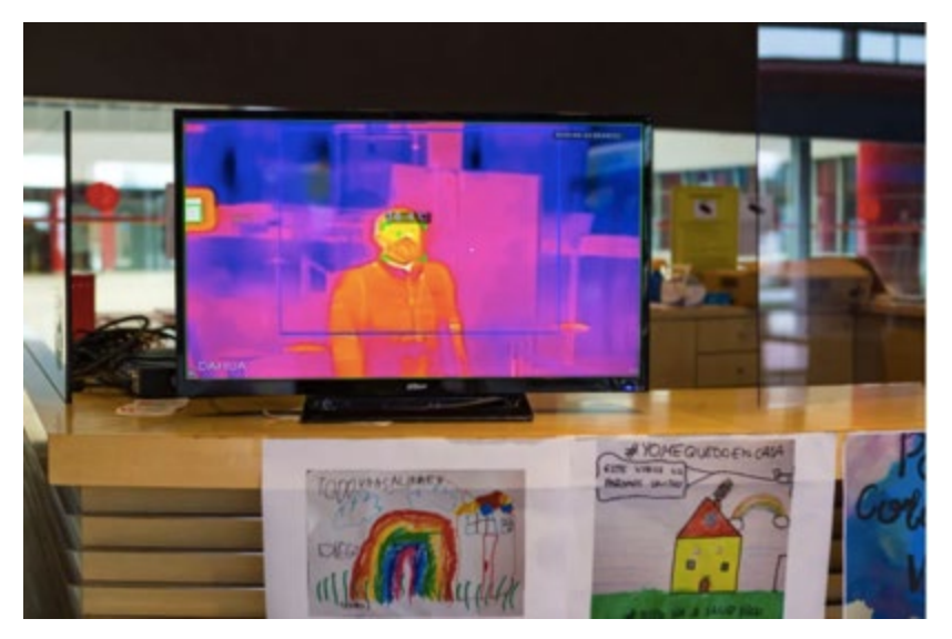
Figure 3 Thermal imaging in use at the entrance to a hospital in Spain.

Additionally, on March 17, 2020, the U.S. Equal Employment Opportunity Commission (EEOC) issued an update to its guidance indicating that employers may implement temperature-screening measures in response to the COVID-19 pandemic. The EEOC noted, "Because the CDC [Centers for Disease Control and Prevention] and state/local health authorities have acknowledged community spread of COVID-19 and issued attendant precautions, employers may measure employees' body temperature."