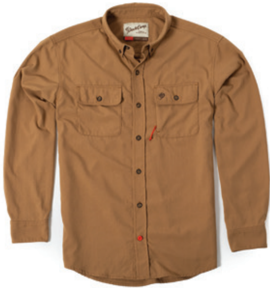
MIDWEIGHT SHIRT - LONG SLEEVE Mallard Green, Pintail Brown, Upland, ES Wetland, LS Wetland, ES Woodland, LS Woodland, Midland $89 M - 3XL $99 TALL OPTION AVAILABLE