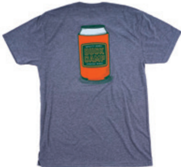
COLD DRINK T-SHIRT Heather Gray, Espresso $25 S - 3XL