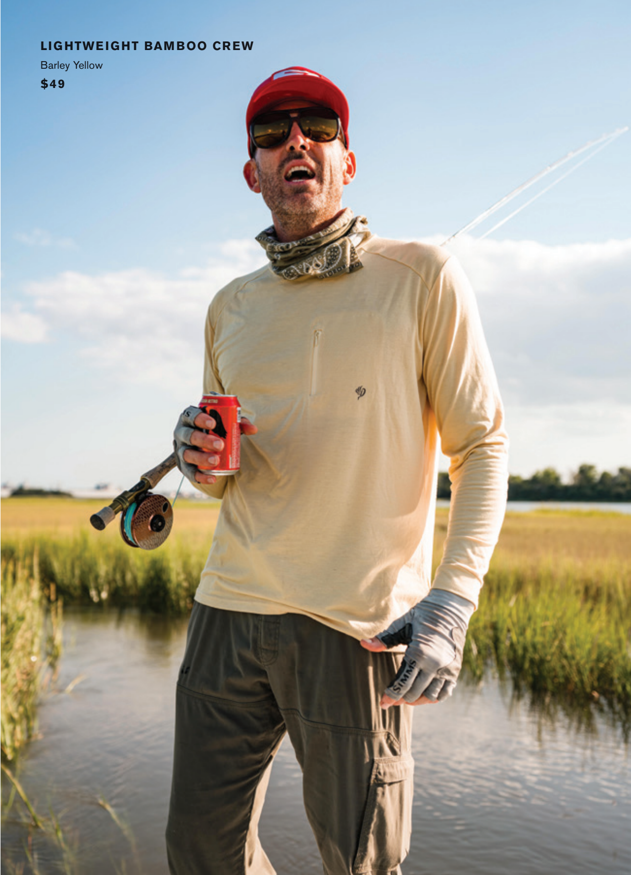
LIGHTWEIGHT BAMBOO CREW Barley Yellow $49

Nailed it. I've owned every iteration of a fishing shirt in the last 40 years and you nailed it. Fit true to size and that bamboo is soft in a light quick dry. Vertical is the right way to zip a shirt you may be trying to open one handed." - David C, Texas