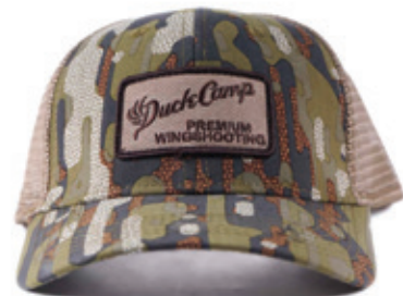
ES WOODLAND HAT ES Woodland $29*