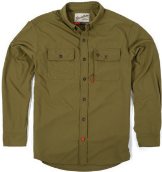
MIDWEIGHT SHIRT - LONG SLEEVE Mallard Green, Pintail Brown, Upland, ES Wetland, LS Wetland, ES Woodland, LS Woodland, Midland $89 M - 3XL $99 TALL OPTION AVAILABLE