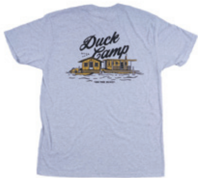
FLOATING CAMP T-SHIRT Light Heather Gray, Charcoal $25 S - 3XL