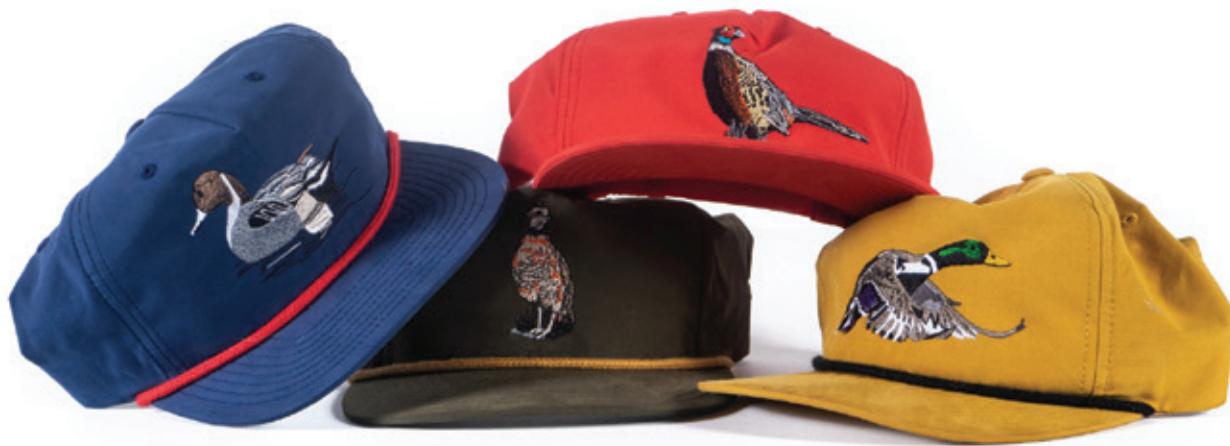
GAME BIRD HATS $29*