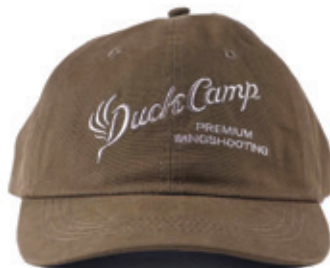
DUCK CAMP HAT Olive Green $29*