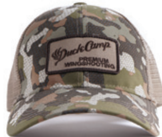
ES WETLAND HAT ES Wetland $29*