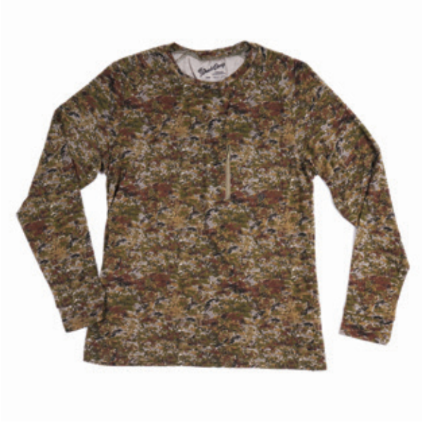
BAMBOO LIGHTWEIGHT CREW SHIRT - WOMENS Midland, ES Woodland, ES Wetland, Barley Yellow, Pluff Mud Gray $49 (SOLID) - $54 (CAMO) S - 2XL