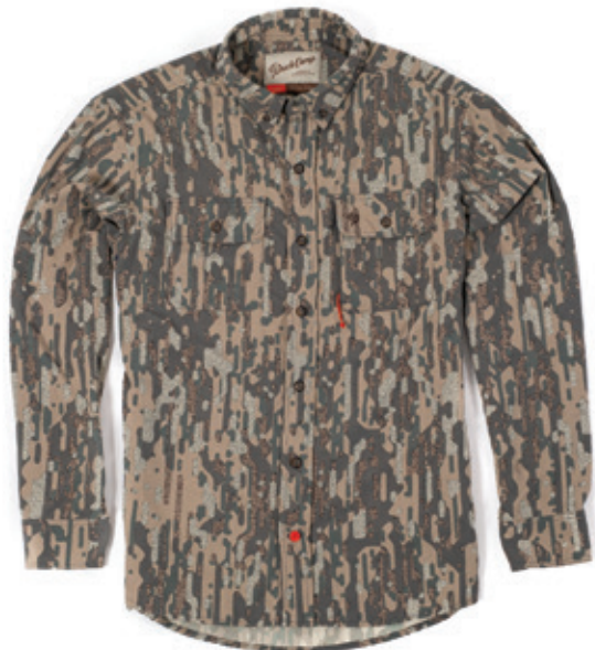
MIDWEIGHT SHIRT - LONG SLEEVE Mallard Green, Pintail Brown, Upland, ES Wetland, LS Wetland, ES Woodland, LS Woodland, Midland $89 M - 3XL $99 TALL OPTION AVAILABLE