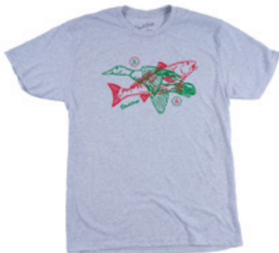
GREENHEAD X REDFISH T-SHIRT Light Heather Gray $25 S - 3XL