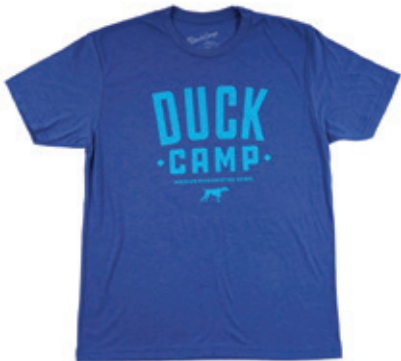
DUCK CAMP POINTER T-SHIRT Blue, Forest Green $25 S - 3XL