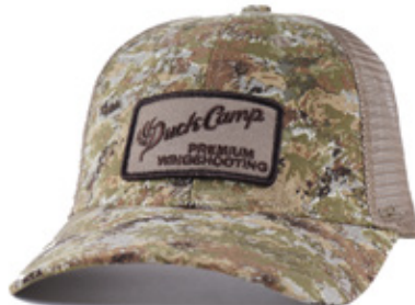
MIDLAND TRUCKER HAT Midland $29*