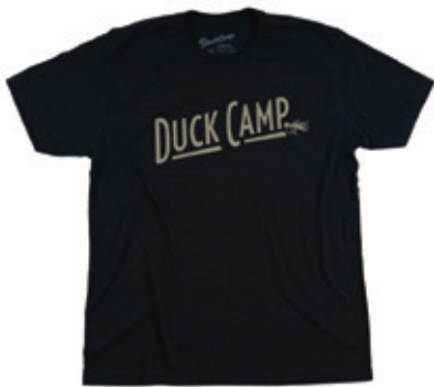
DUCK CAMP POPPER T-SHIRT Heather Gray, Black $25 S - 3XL