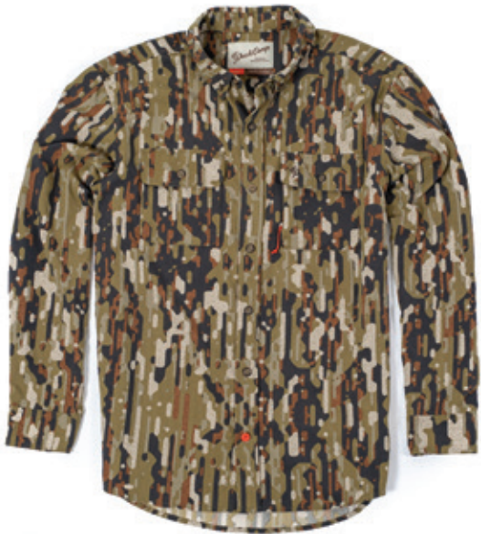
MIDWEIGHT SHIRT - LONG SLEEVE Mallard Green, Pintail Brown, Upland, ES Wetland, LS Wetland, ES Woodland, LS Woodland, Midland $89 M - 3XL $99 TALL OPTION AVAILABLE