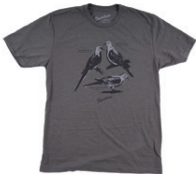
DOVE OPENER T-SHIRT Light Heather Gray, Charcoal $25 S - 3XL