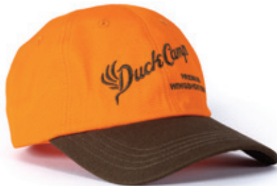
UPLAND WINGSHOOTER HAT Upland $29*