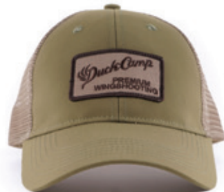
MALLARD GREEN TRUCKER HAT Mallard Green $29*