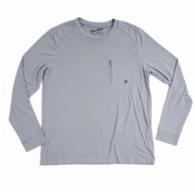
BAMBOO LIGHTWEIGHT CREW SHIRT - MENS Midland, ES Woodland, ES Wetland, Barley Yellow, Pluff Mud Gray $49 (SOLID) - $54 (CAMO) S - 3XL