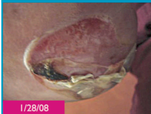
BEFORE USING DERMASAVER STAY-PUT HEEL PROTECTOR