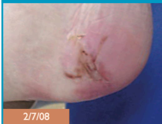
AFTER USING DERMASAVER STAY-PUT HEEL PROTECTOR