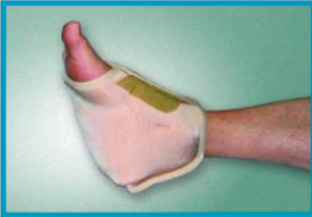
DERMASAVER STAY-PUT HEEL PROTECTOR

9-29-07: This resident's feet have external rotation when at rest (in bed or in recliner) and he has had two stage 2 pressure ulcers on the outer malleolus's of both ankles since admission. We have been trying duoderm dressing and booties at HS (cloth covered cotton boots) for approximately 3 months. When the wounds would resolve to a stage 1, the duoderm would be removed, and the booties were continued, but they did not stay in place and constantly had to be re-applied several times throughout the night (interfering with his sleep), and resulting in the return of the the stage 2 ulcers. We would then repeat the process; this has continued for the last 3 months. We decided to try the DermaSaver Stay-Put Heel Protectors. With this product alone, we had the stage 2's resolved to stage 1's within one week. Plus they remained in place throughout the night. (The resident was very relieved to be able to sleep uninterrupted!) He was able to ambulate with them on, which allowed him to remain independent with his toileting needs.