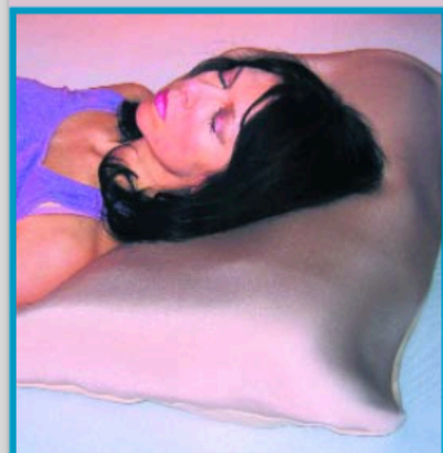
DERMASAVER PRESSURE REDUCTION PILLOW CASE