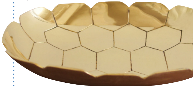
Turtle Shell Brass Tray: $78; High Street Market

High Street Market, the online home furnishings and accessories shop known for its select vintage finds, is now selling new merchandise of original design, such as this charming turtle-shell tray made of heavy polished brass.