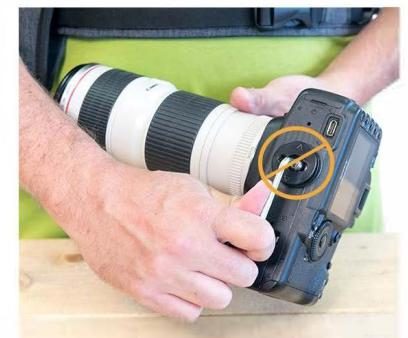
CAREFUL: putting the arrows the wrong way will put your camera at risk of falling out of the Harness.