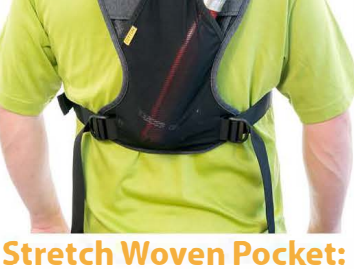
Located on the back of the Harness for small to medium sized storage

Stash Pocket: Simple pocket on the front of the Harness for storage of small items.