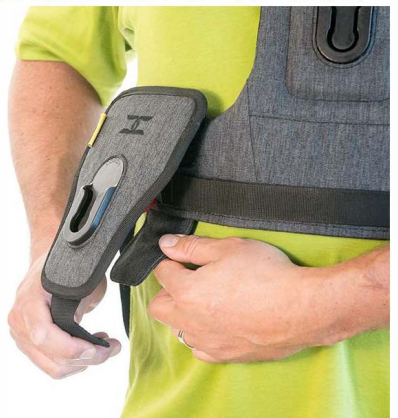
6. Attach the Side Holster to the Camera Harness using the Velcro Wraps. Alternatively, you can attach the Side Holster to your belt or the waist strap of your backpack.