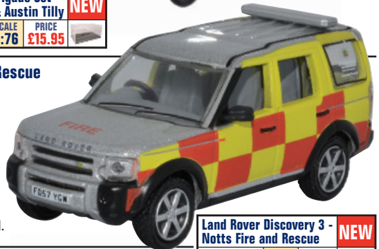
Land Rover Discovery 3 - Notts Fire and Rescue NEW 76LRD005 SCALE 1:76 PRICE £4.75

Supplement your modern Fire emergency fleet with this contemporary Land Rover Discovery, registered FD57 YGW, as used by the Nottinghamshire F & R Service. Modified to take a light bar on the roof and decorated in white with orange/yellow Battenberg masking, the model also features an abundance of satin black trim. FIRE is printed on the boot and on the front of the bonnet in flame orange and the model is rounded off with grey interior seating, black dashboard and black steering wheel.