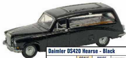
Daimler DS420 Hearsé - Black

A lovely addition to our 1:76 range comes in the form of a Royal Daimler Hearsé. With an extended wheelbase, this majestic looking vehicle would have been seen at funerals of the aristocracy.