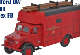
76BD002 SCALE 1:76 PRICE £8.95