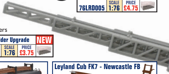
Leyland TLM Ladder Upgrade NEW 76TLM LADDER SCALE 1:76 PRICE £3.75

For those collectors who have the Leyland TLM fire engine in your Oxford fire fleet, you now have a chance to upgrade the roof ladders. The vehicles were initially made with static ladders but then upgraded to incorporate a working extendable ladder. This new release enables you to do the same to your own appliances.