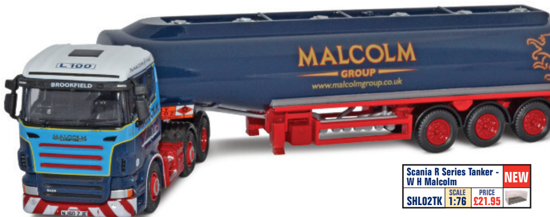
Scania R Series Tanker - W H Malcolm