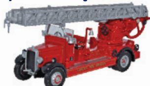
76TLM001 SCALE 1:76 PRICE £10.95