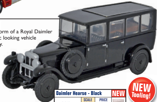
Daimler Hearsé - Black