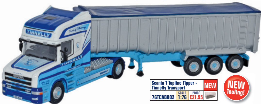
Scania T Topline Tipper - Tinnelly Transport