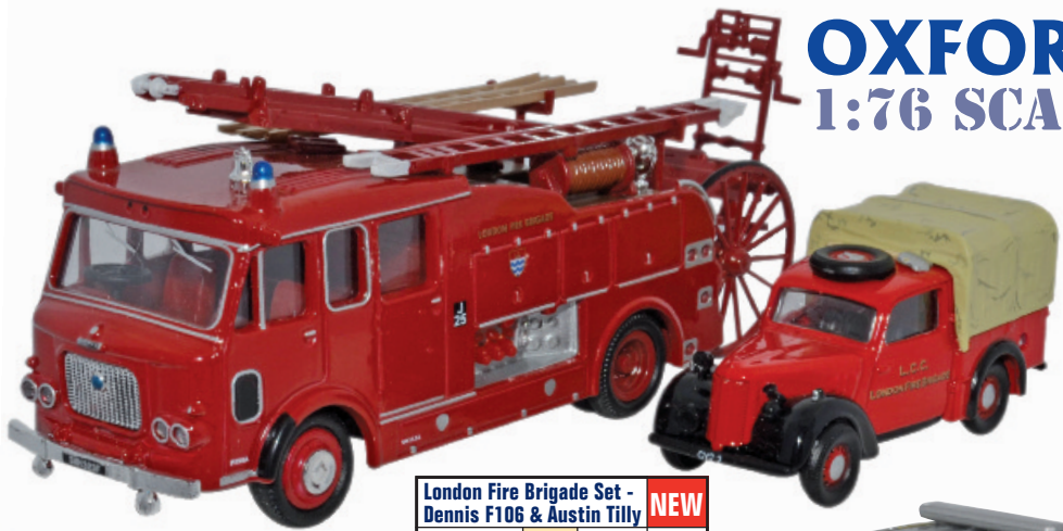
London Fire Brigade Set - Dennis F106 & Austin Tilly NEW 76SET24 SCALE 1:76 PRICE £15.95