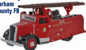
76DL4003 SCALE 1:76 PRICE £11.95