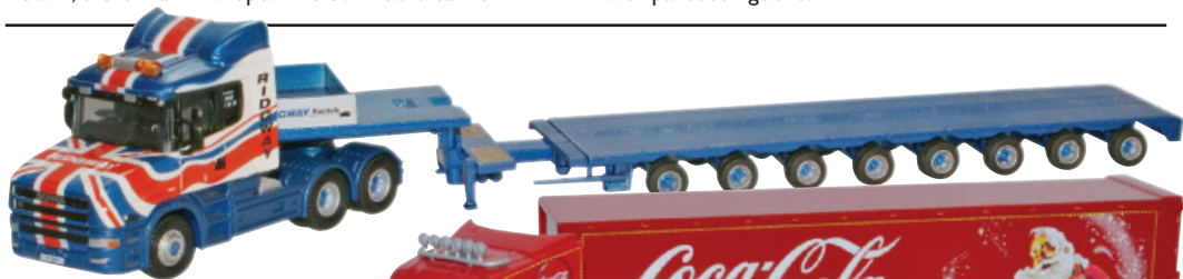
Scania T Cab Low Loader - Ridgway Rentals

include non-ferrous metals, coal, aggregates, woodchip, cereals, feeds and various other bulk commodities. As well as in excess of 60 bulk tippers, the Company also runs tautliners delivering and collecting palletised loads and chipliners taking sawdust to the UK and returning with palletised goods.