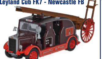
76LC001 SCALE 1:76 PRICE £9.95