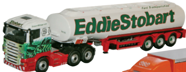
Scania Highline Tanker - Eddie Stobart