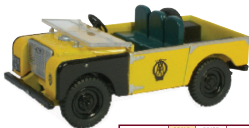
Land Rover 80 inch - AA