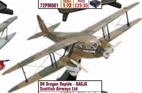
DH Dragon Rapide - GAGJG Scottish Airways Ltd