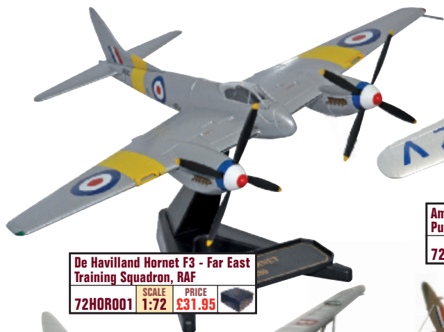
De Havilland Hornet F3 - Far East Training Squadron, RAF