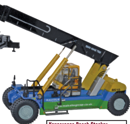
Konecranes Reach Stacker - W H Malcol