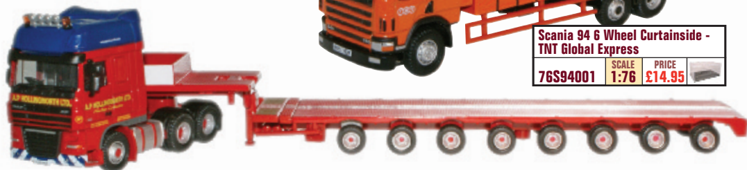
DAF Low Loader - A P Hollingworth