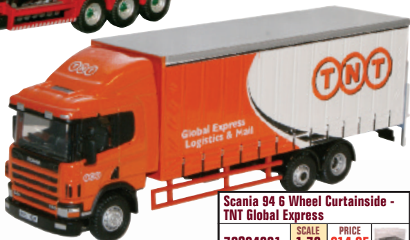
Scania 94 6 Wheel Curtainside - TNT Global Express