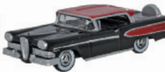
1958 Ford Edsel Citation - Black/Amber Red

Iconic American cars from a bygone age, many of which appeared in the 1940s and 1950s. An era which featured distinctive body shapes, many with exaggerated features.