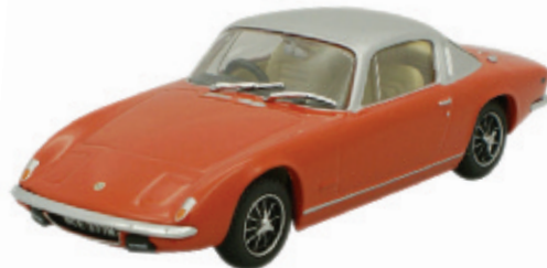
Lotus Elan Plus 2 - Red/Silver