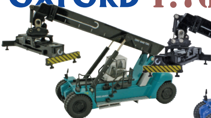
Konecranes Reach Stacker - Blue