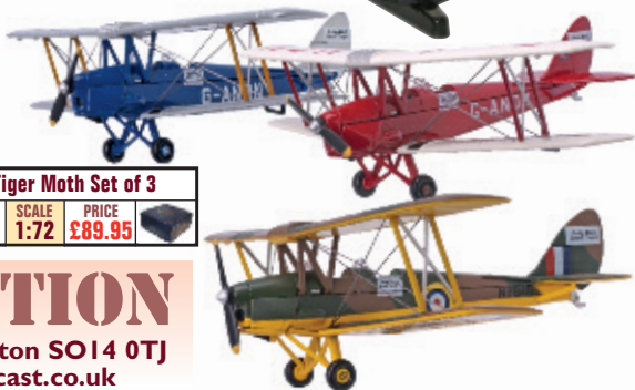
Glasmoth Tiger Moth Set of 3