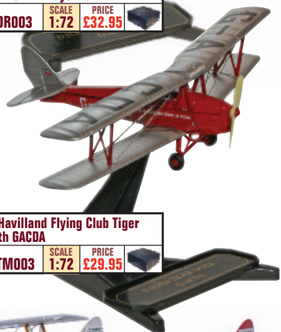
De Havilland Flying Club Tiger Moth GACDA