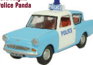
Ford Anglia Police Panda

A selection from our popular range of 1:76 scale Police vehicles, celebrating the last 50 years of patrol vehicles.