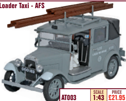
Low Loader Taxi - AFS