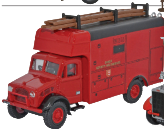
Bedford OW Luton - Essex Fire Brigade