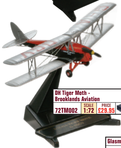
DH Tiger Moth - Brooklands Aviation