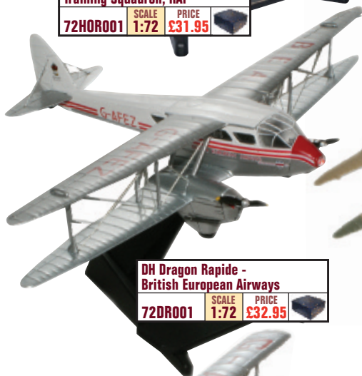
DH Dragon Rapide - British European Airways