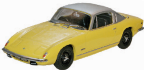
Lotus Elan Plus2 - Yellow/Silver