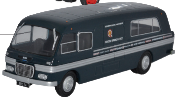
BMC Mobile Training Unit