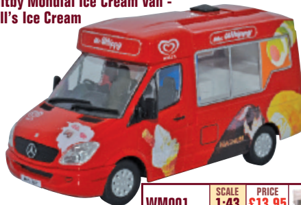
Whitby Mondial Ice Cream Van - Wall's Ice Cream