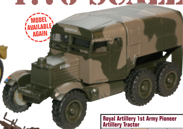
Royal Artillery 1st Army Pioneer Artillery Tractor