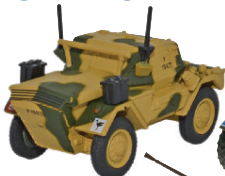
Dingo Scout Car - 50th RTR, 23rd Armoured Brigade