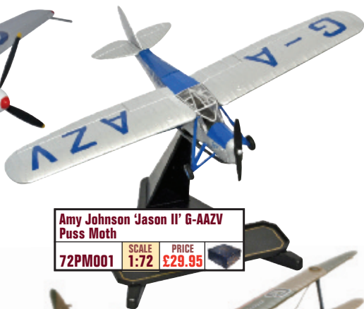
Amy Johnson 'Jason II' G-AAZV Puss Moth