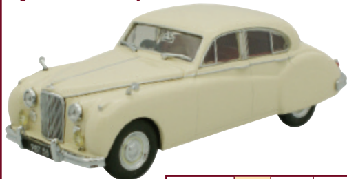
Jaguar MK VIIM - Ivory