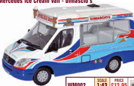
Mercedes Ice Cream Van - Dimascio's