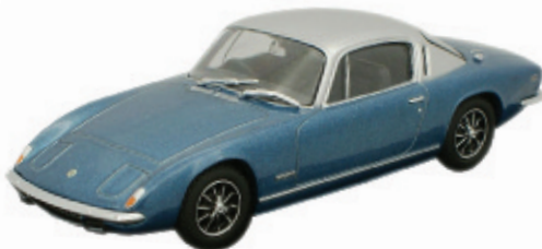
Lotus Elan Plus 2 - Lagoon Blue/Silver