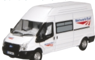
Ford Transit - Network Rail