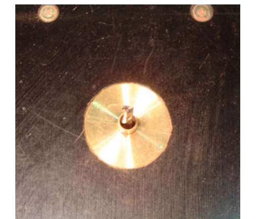
Bit must be centered in bushing.

1. Using the supplied O-ring as a lock washer, secure the bushing in the router table plate. Use either the "Standard" bushing or the slightly (.005") smaller "Slip" bushing if a slightly loser fit is desired. The variation in individual router performance makes it impossible to say that you always use one bushing versus another. Use the slip bushing if your joints are too tight with the standard bushing. If you have large gaps make sure you are using the correct bit. All joints use a 3/16" straight router bit (WL – 1002S-ES). If your joints are too loose you can tighten them by wrapping a small piece of clear tape around the standard bushing. It only takes a couple of loops to make a difference.