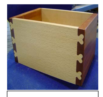
Heart Joints made half blind.

Tails are typically the male portion of the heart dovetail. To produce a joint as shown, clamp the material to be cut into the jig using the gauge block to set the amount of overhang as shown in Figure 19 and 20.