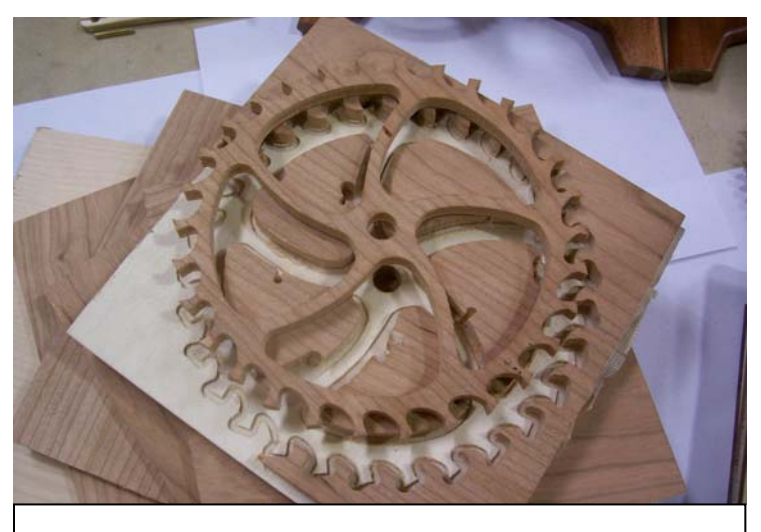
Figure 3 Microwave to remove from backer board

Bit selection is important for quality part production. Spiral bits are best for most types of pin routing applications. Only up spirals should be used. An up spiral bit will pull the chips out of the cut and make cutting easier with less tear-out or loading. Spirals produce the smoothest possible cut but due to small size can wear more quickly. If you experience burn marks or excessive pressure is required the bit may be dull. Bit life will depend on the type of wood and how aggressively you cut it. Solid carbide bits