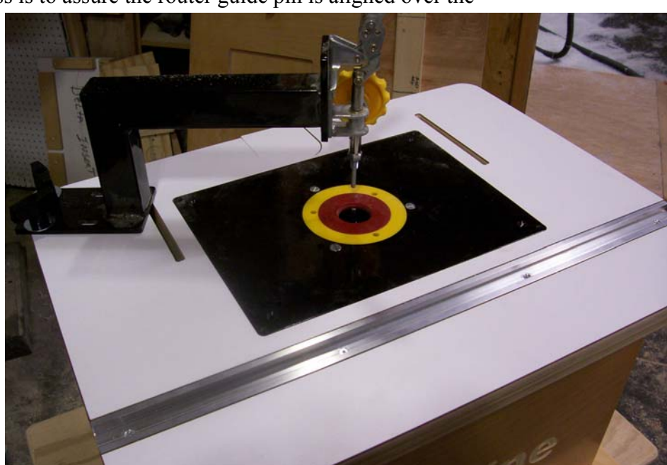
Figure 2 Pin router can be bolted or clamped to any table

Drill a hole the same diameter as the bit and guide pin in a