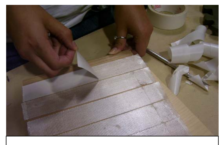
Figure 4 Use heavy duty double stick tape

with a band saw to free the parts from the block. The parts can then be sanded to final thickness.