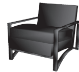
Accent Chair 3.5 yds = 63 sq ft