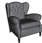
Chesterfield Chair 8.5 yds = 153 sq ft