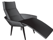
Chaise Lounge 7 yds = 126 sq ft