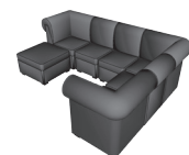
Sectional 39.5 yds = 711 sq ft