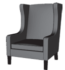
Wingback Chair 5 yds = 90 sq ft