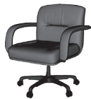
Task Chair 3 yds = 54 sq ft