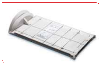
The high-quality folding mechanism guarantees a long service life.

The seca 417 stadiometer is ideal for mobile use. During regularly scheduled examinations, medical personnel check the nutritional condition and development of infants and toddlers. The process should go quickly, so it's important to be able to read results easily. The red markings and high-quality printing of the scale don't fade even after years of intense use.