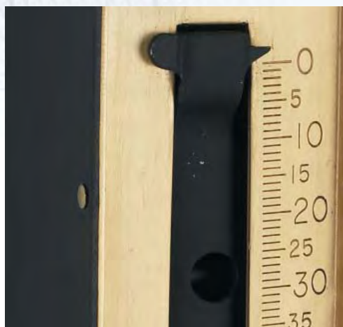
Easy to read graduations