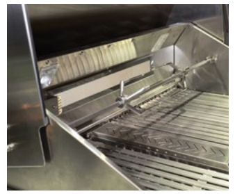
Flush Mounted Rotisserie

Infrared-Zone Cooking with a 10mm thick stainless steel flat plate gives you a quick sear with high radiant temperatures of up to 1000°C that keeps food tastier and healthier.