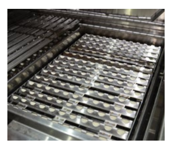
Stainless Steel Ceramic Rods

Featuring Lift-Assist technology to provide easy access and reduce energy required to open the hood. The double layered hood reduces heat loss and maintains safe external hood temperatures while minimizing heat discoloration and warping.