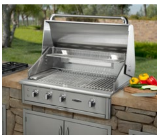
Quality Hand Crafted Construction

Zone cooking allows optimisation of temperature zones. Each burner has a heat divider between them which prevents the heat diverting to the neighbouring zone.