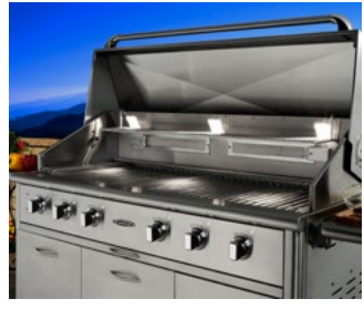
Two Year Full Warranty

Capital offers a Two Year Full Warranty covering all parts and labour to ensure peace of mind.