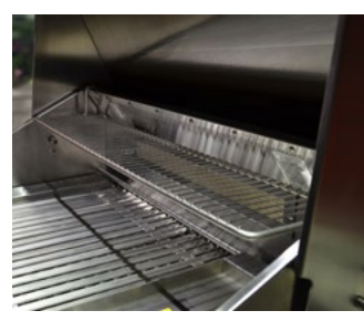
Removable Warming Rack

Stainless Steel Ceramic Rods are a Capital exclusive.