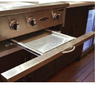
Smart Drip Tray

12" wide, 10mm thick stainless steel grill plate designed for usage above the 30 Mj Infrared Zone Burner, allowing it to reach extremely high temperatures. The thickness of the plate helps to make it extremely durable and maintain temperatures.