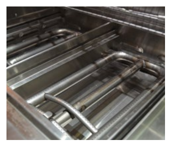
Zone Cooking Feature

Provides additional cooking space and room to cool your perfectly cooked meats before serving. Can be easily removed.