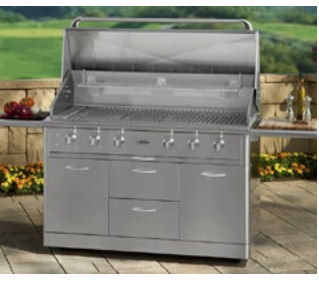
Stainless Steel Hood

Smart drip system which catches fats and oils. Sitting below the grill surface, the tray is supported by a ball bearing slide system and is removable to make it easy to clean.