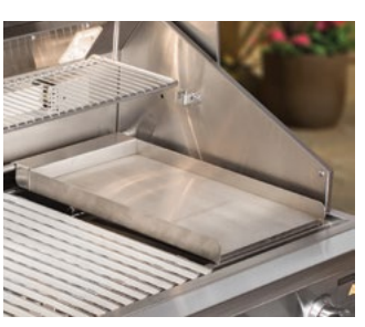
Stainless Steel Grill Plate

Capital offers a Two Year Full Warranty covering all parts and labour to ensure peace of mind.