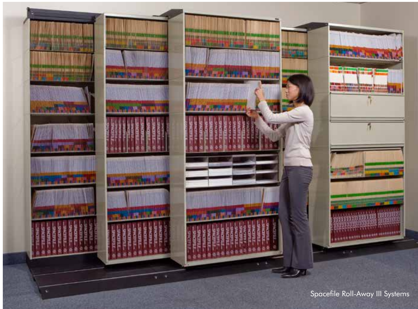
Spacefile Roll-Away III Systems

SPACEFILE'S SMART HIGH DENSITY STORAGE SYSTEM