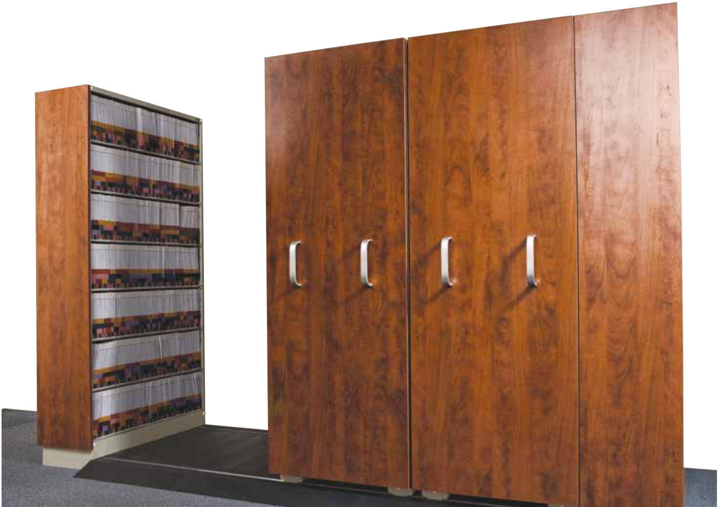
MSA Mini Storage Aisle

The Mini Storage Aisle (MSA) is a mobile front-to-back system available with fixed, single and double width carriages allowing access from either side. The system offers security without cumbersome doors!