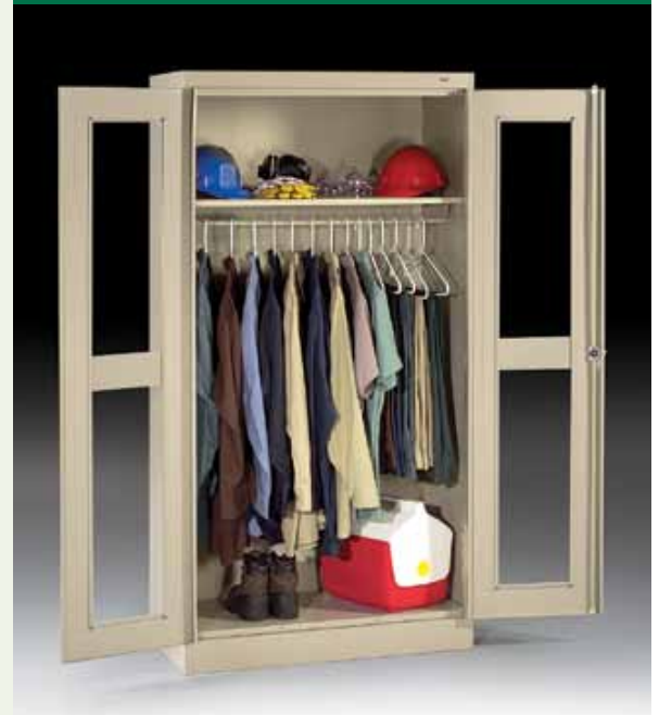
C-Thru Wardrobe Cabinet