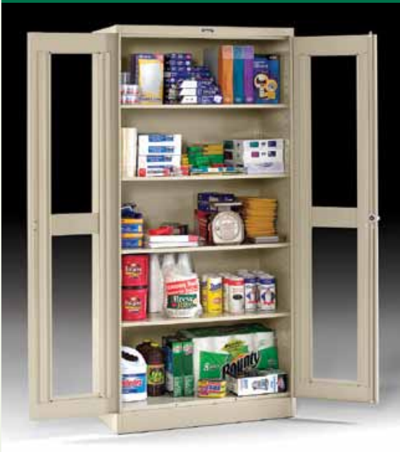
C-Thru Storage Cabinet