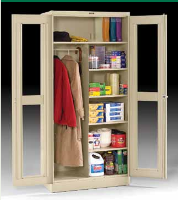
C-Thru Combination Cabinet