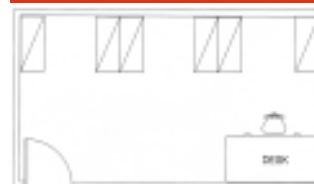
Cabinets or Shelving