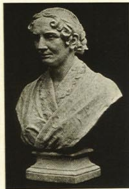
HARRIET BEECHER STOWE No. 5504 Height, 2 ft. 8 in. . $20.00