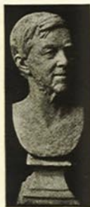
HOLMES No. 5458 Height, 1 ft. 11 in., $6.00