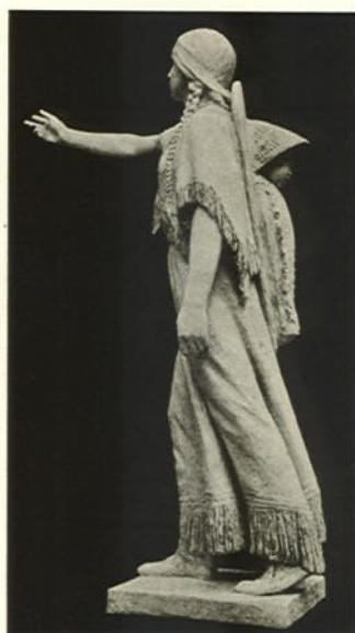
REAR VIEW OF Nos. 2923, 2924 showing papoose

No. 2923 Height, 6 ft. . . . $100.00 2924 Height, 3 ft. 1 in. . . . 30.00 Base, front to back, 11½ in.; width, 8¼ in.