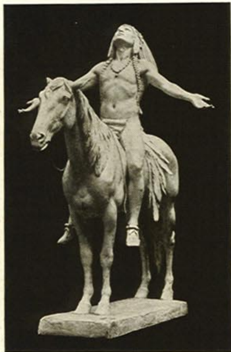
THE APPEAL to the GREAT SPIRIT*

Original in bronze, heroic size, at Panama-Pacific Exposition No. 2904. Height, 3 ft. 2 in. . . . $50.00