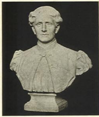
FRANCES E. WILLARD No. 5505 Height, 2 ft. 8 in. . $20.00