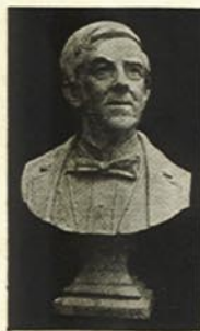
HOLMES No. 5459 Height, 2 ft., $8.00

Liberal discount to schools and other educational institutions