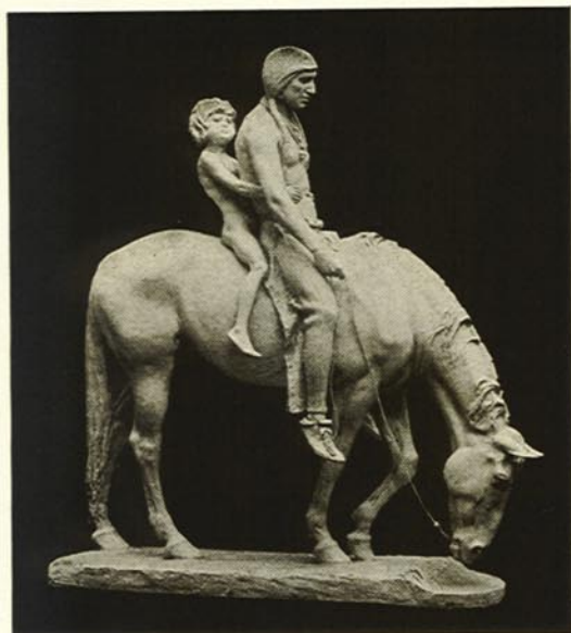
CAYUSE AT SPRING*

No. 2913 Height, 3 ft. 3 in. . . . . $50.00