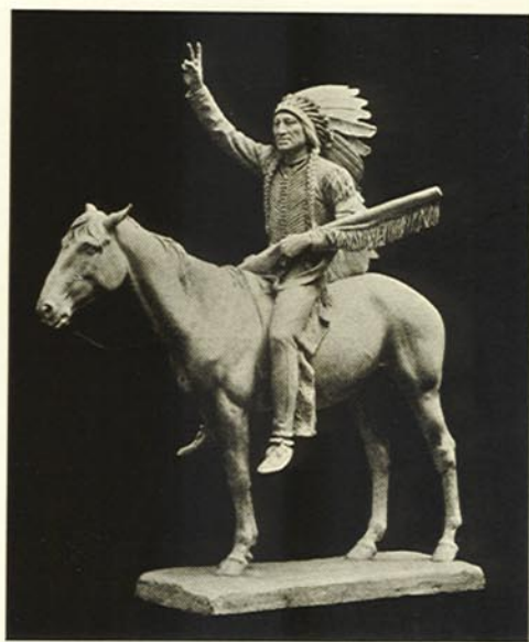
CHIEF WASHAKIE. SHOSHONE TRIBE*

No. 2913 Height, 3 ft. 3 in. . . . . $50.00