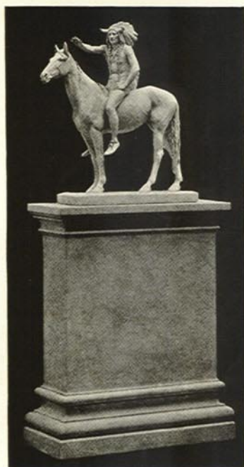
MEDICINE MAN No. 2880 ON PEDESTAL No. 2880A

Liberal discount to schools and other educational institutions