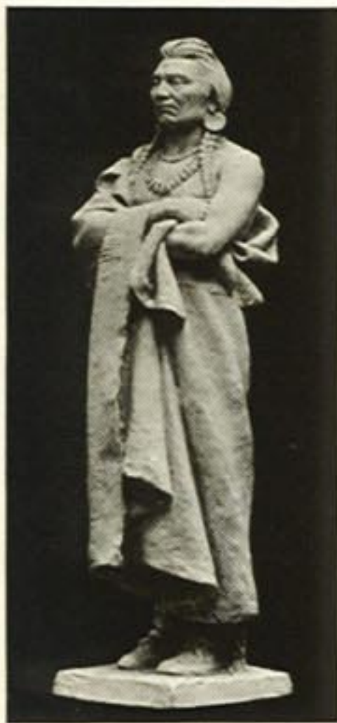
CHIEF JOSEPH Nez Percéz Tribe

No. 2919 Height, 2 ft. 6 in. $20.00 Base, front to back, 10 in. width, 7 in.