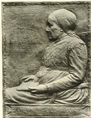
JULIA WARD HOWE Original in marble in Museum of Fine Arts, Boston No. 10083 38 x 29 in. . $20.00