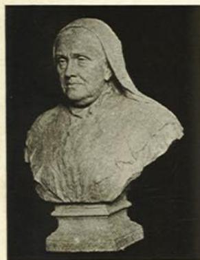
JULIA WARD HOWE No. 5503 Height, 2 ft. 8 in. . $20.00