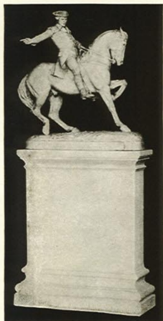
PAUL REVERE No. 2872 ON PEDESTAL No. 2872A

From the original model, accepted by the Committee for the Erection of the Paul Revere Monument in Boston, and approved by the Boston Art Commission.