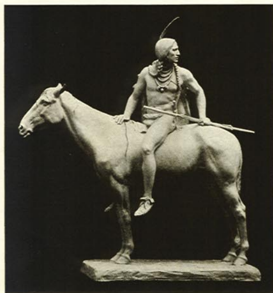
ON THE WARPATH. SIOUX TRIBE*

No. 2915 Height, 3 ft. 4 in. . . . . $50.00