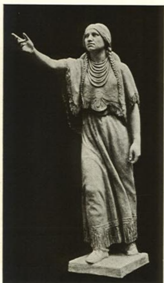
SACAJAWEA the Indian woman, who led Lewis and Clark on their expedition to the Pacific Ocean