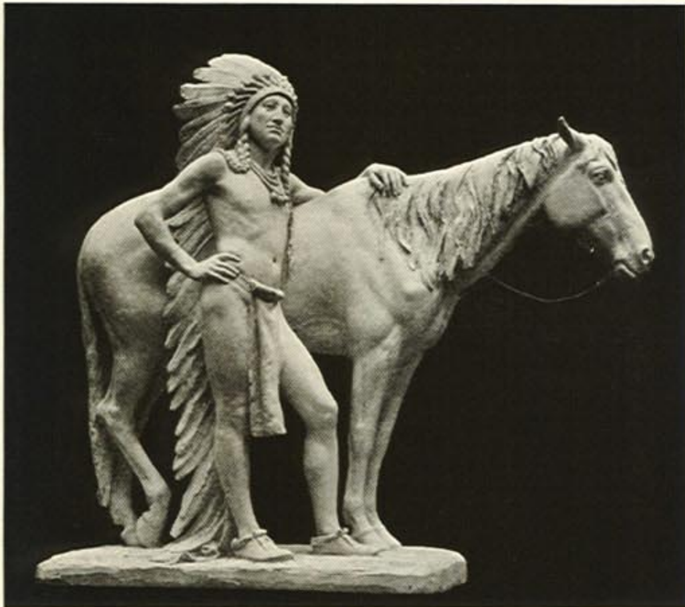
CHIEF ANTELOPE *

No. 2918 Height, 2 ft. 10 in. . . . . $50.00