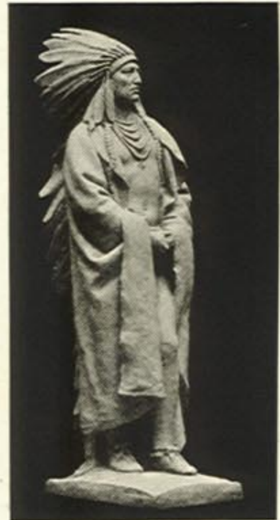
STANDING ELK Ute Tribe

No. 2918 Height, 2 ft. 10 in. . . . . $50.00