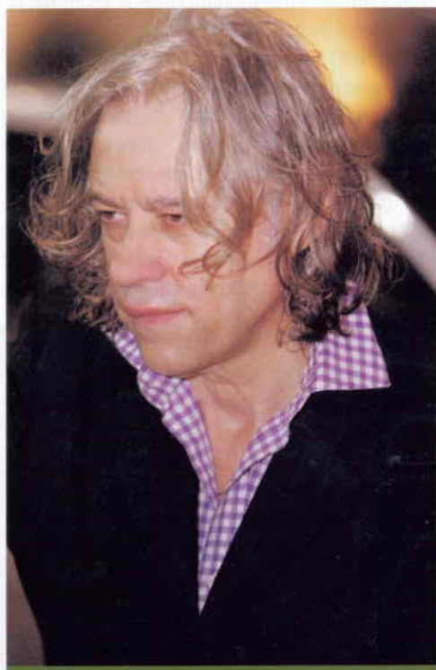
Bob Geldof says Africa is going through a mini-boom.

"Europe's growth is about 1.8 per cent, Africa's does about five to six per cent continentally economic growth. So the continent has taken off," he said.