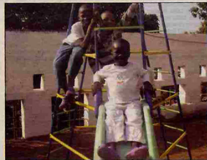
AT PLAY: Some of the children playing in the outdoor area

For those willing to help, please contact info@aaodubai.org or call 04 311 6578.