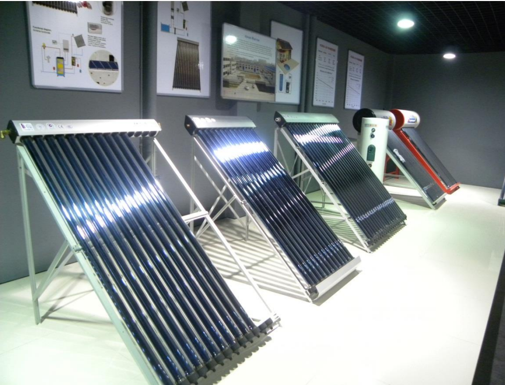
(Collecteur Solaire-Solar Collector)