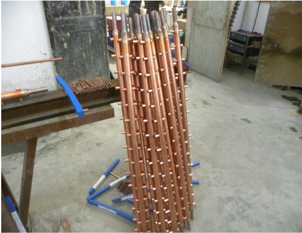
( Collecteur-Manifold Main Pipe)