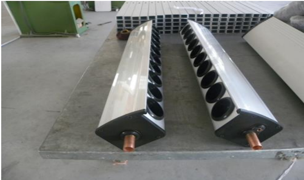
( Collecteur-Manifold )

h).Résistance à la grêle - Hail Resistance : 25mm