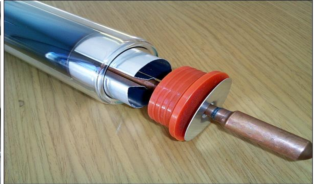
(Element Chauffant-Heat Pipe Tube )