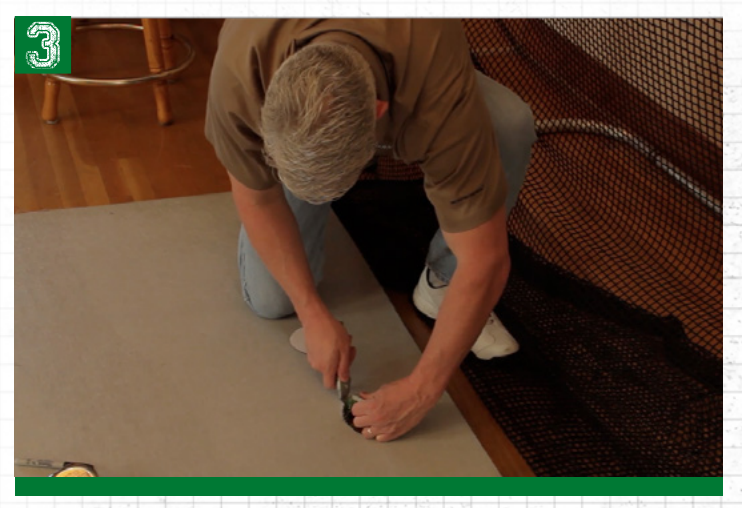
Use the black marker to trace the template; with the utility knife carefully cut out the hole.