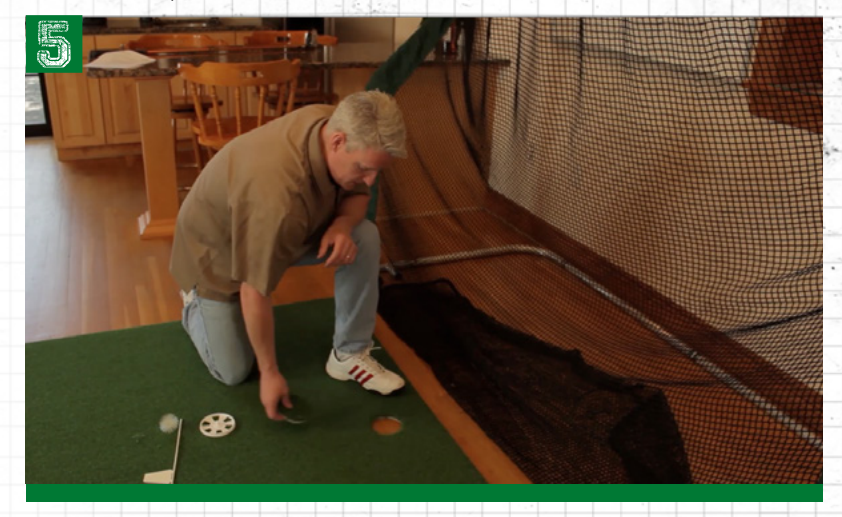
Flip the turf over and start putting. Note: If you purchased the putting cup and flag accessory (3 pieces), continue with steps 6 and 7.