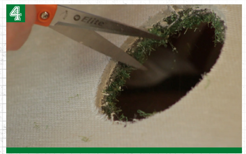
Trim off any residual nylon with your scissors, creating a clean hole.