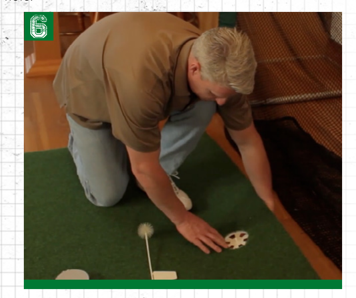
The bottom piece of the cup snaps in underneath your turf.