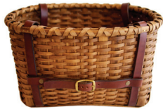
Black Ash Market Basket ($550)

Each basket splint is hand pounded, cut, shaved, and shaped to ensure the uniqueness and quality of every basket. Made in Upstate NY by Swamp Road Baskets.