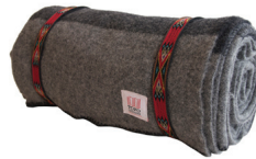
Wool Blanket in Grey with Red Accessory Straps ($200)

Camp blanket is made of 100% wool. Accessory straps are 1" nylon webbing and plastic hardware. From Topo Designs of Colorado. Made in Colorado.