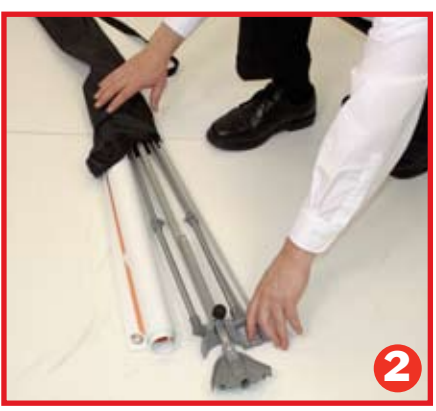
Remove the contents of the bag.