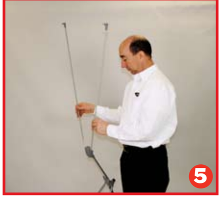
Install the upper arms into the adjustable hub.