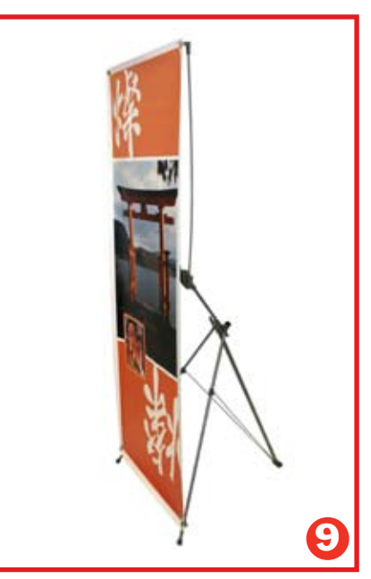
Your completed unit should stand upright.