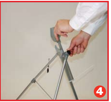
Adjust the hub size to the correct graphic height by turning the tension screw clockwise. Be sure to not over tighten otherwise breakage may occur.