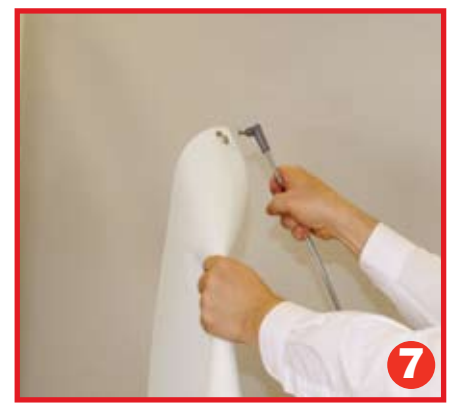
Mount the grommets, located on the top of the graphic, to the top hooks.