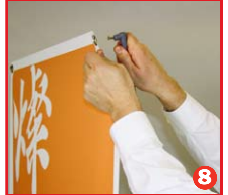
Once the graphic is installed, using the tension screw, make your final height and tension adjustment to fully secure the graphic to the stand.